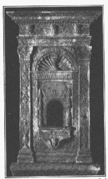
CIBORIUM, DATED 1531. PALAZZO COMUNALE, ROME

A chalice-like vessel used to contain the Blessed Sacrament. The word is of rather doubtful etymology, Some derive it from the Latin word cibus , "food", because it is used to contain the Heavenly Bread; while others trace it to the Greek kirorion , "cup", because of the original shape of this Eucharistic receptacle. The term was also applied in early Christian times to the Canopy that surmounted and crowned the altar ( see article ALTAR CANOPY ), but according to modern liturgical usage the word denotes exclusively the sacred vessel employed for the reservation of the Consecrated Species. At the present day two vessels are used to reserve the Blessed Sacrament: one, called a pyx , is a small round box and serves for carrying the Blessed Sacrament to the sick; the other, generally styled a ciborium , is used for distributing Holy Communion in churches and for reserving the consecrated particles in the tabernacle. In shape the ciborium resembles a chalice, but the cup or bowl is round rather than oblong, and provided with a conical cover surmounted by a cross or some other appropriate device. The bottom of the cup should be a little raised at the centre so that the last particles may be easily removed and the purification more conveniently performed. The material should be gold or silver (base metals are sometimes allowed), but the interior of the cup must be always lined with gold. The ciborium is not consecrated, but blessed