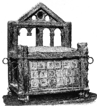
CHAIR OF ST. PETER (Vatican Museum)