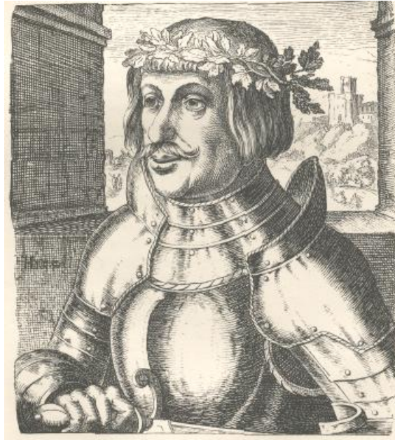
Ulrich von Hutten -- P. 98

It was for the schools and universities that reformers first sprung up in Erasmus and Reuchlin; then, almost at the same time, an Ulrich von Hutten began to call on his countrymen to feel and to assert their national unity and their ancient rights against Italian priests and Spanish mercenaries, and to reform their own lives. His vigorous appeals, expressed, not in Latin, but in clear and trenchant German, made themselves heard by all classes, and helped to pave the way for the reformation that was coming. The following poem, written when he had been forced to seek an asylum in the castle of his friend Franz von Sickingen, was ere long circulated all over the country on broadsheets, and became a favourite song of the earliest adherents of the Reformation.