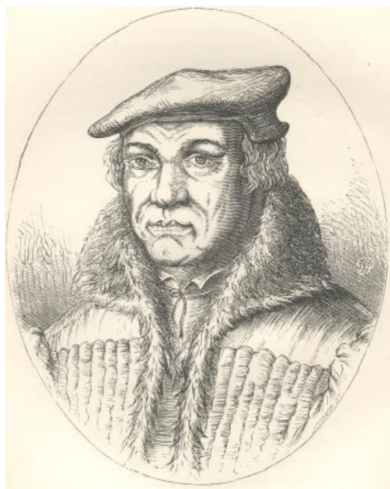
Justus Jonas -- P. 115